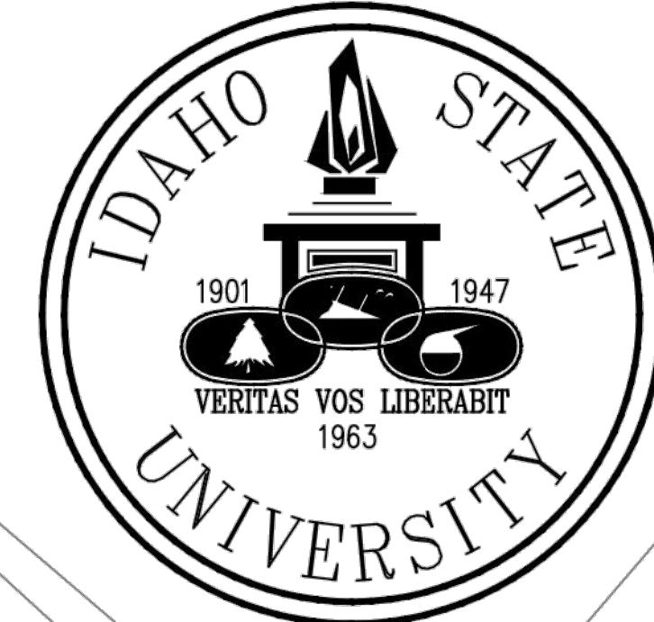
IDAHO STATE UNIVERSITY CAMPUS MAP APPROXIMATE SCALE: 1" = 200'-0"